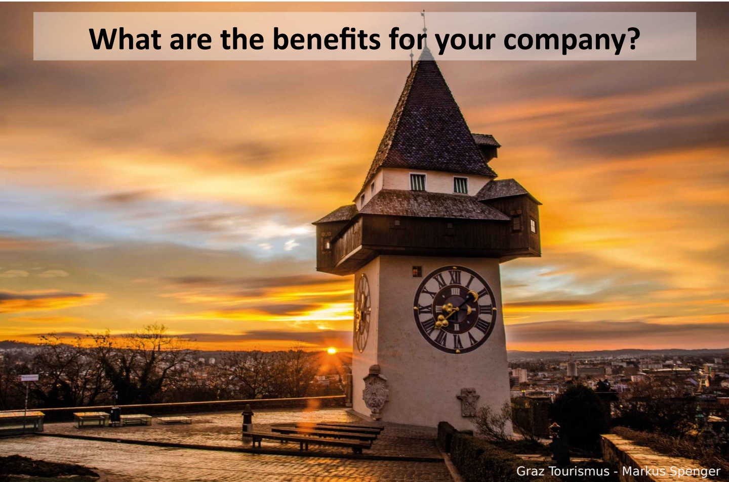
Graz Tourismus - Markus Spenger